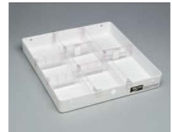
Exchange Tray LEC9460 (with extra divider) or LEC9461 (with extra divider)